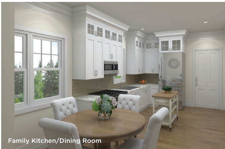
Family Kitchen/Dining Room

The vast majority of people at the end of their life would prefer to die at home. Sadly, there are many more situations where it's not feasible to