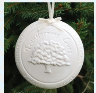
"Transforming Lives" ornament

Beautiful light towers in the yard of our offices will be illuminated with the names of all those individuals memorialized in our Light A Life program. The towers will be revealed and illuminated at the Memorial Service and will remain illuminated through the holiday season for individual reflection.