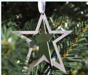
Memorial Tree Star

Each holiday season Chautauqua Hospice & Palliative Care presents our Light A Life Memorial as a tribute to loved ones who are no longer with us. This is a time of remembrance not just for the families we have served; we invite all community members to participate regardless of whether or not we cared for their loved one. There are several ways to participate- pick the one that's right for you: