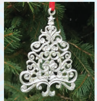
Pewter tree ornament

Beautiful keepsake ornaments make wonderful gifts for the holidays. The $50 hand-cast "Transforming Lives" ornament is hollow and made of translucent porcelain that glows beautifully when a small tree light illuminates it. The $25 pewter tree-shaped ornament is a beautiful addition to any tree. Those memorialized with the purchase of these ornaments will be listed in our Light A Life program and on our Light Towers, as well as have a reflective star hung in their memory on our Memorial Trees.