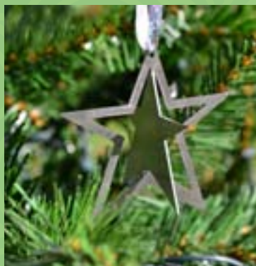
Memorial Tree Star

There are several ways to participate, all of which will include your loved one's name in our Memorial program and light towers.